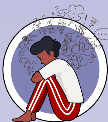
Worsening mental health